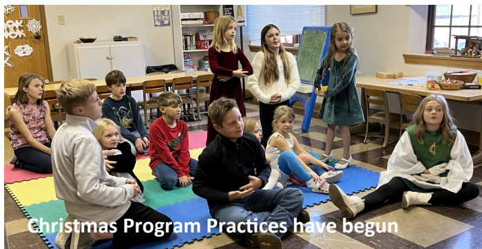
Christmas Program Practices have begun