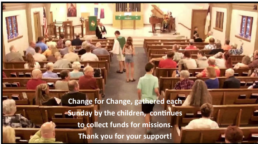
Change for Change, gathered each Sunday by the children, continues to collect funds for missions. Thank you for your support!